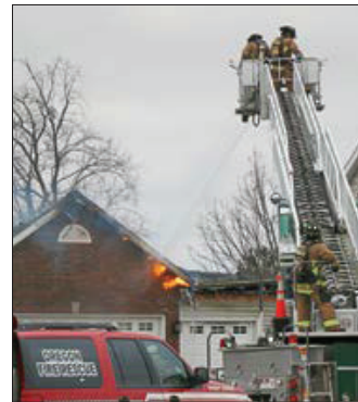
The Fitchburg Fire Department brought a ladder truck to help fight the fire from above. Including the Oregon Area Fire and EMS District, nine departments were involved in fighting the fire.

According to a news release from the Oregon Area Fire and EMS, a call came in at 3:14 p.m. about the fire. While Friday's high winds made it "difficult for firefighters" to extinguish the blaze, they